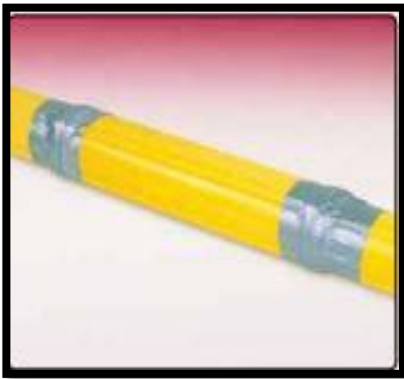
The Close up shows two sections riveted and taped together with a standard length coupling.